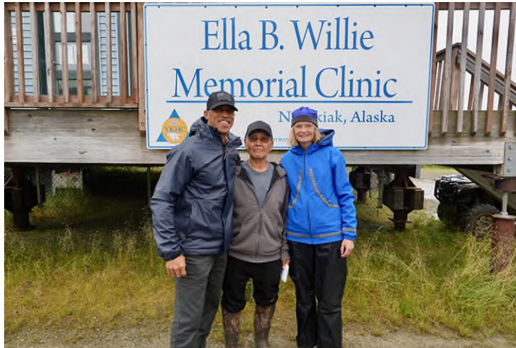
Secretary Scott Turner Visits with Native Villages in Alaska