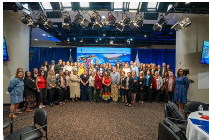
Office of Loan Guarantee Underwriters' Boot Camp Boot Camp Day One Photos | Boot Camp Day Two Photos