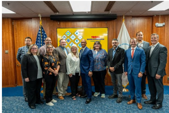
Secretary Scott Turner Hosts HUD's Tribal Intergovernmental Advisory Committee Read Press Release | View Photo album